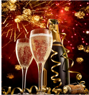
HAPPY NEW YEAR!

“MOST GREAT PEOPLE HAVE ATTAINED THEIR GREATEST SUCCESS JUST ONE STEP BEYOND THEIR GREATEST FAILURE.” NAPOLEON HILL