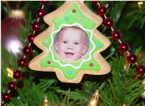
HANGING OF THE FAMILY ORNAMENTS! THIS IS YOURS TRULY AS A BABY HANGING ON OUR FAMILY CHRISTMAS TREE.

Christmas is an important holiday, especially to Christians who celebrate the birth of Jesus. Many of us have traditions while others do not so I thought this would be a great opportunity to mention several different traditions and maybe you and your loved ones can start your own this holiday season.