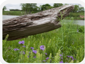
175' OF GUADALUPE RIVER FRONTAGE

This property is arguably the most beautiful lot in the Hill Country. The lot is 6.24 acres and has been cleared ready for a home site. The lot sits on 175 feet of Guadalupe River frontage and panoramic view of the Gua-